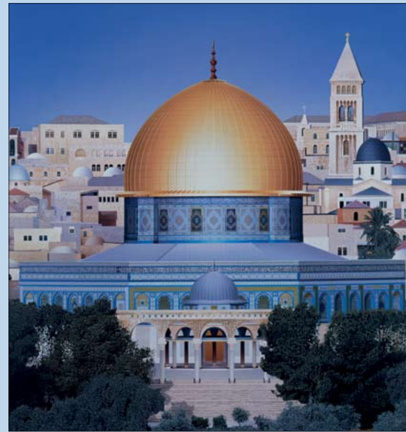
The Dome of the Rock