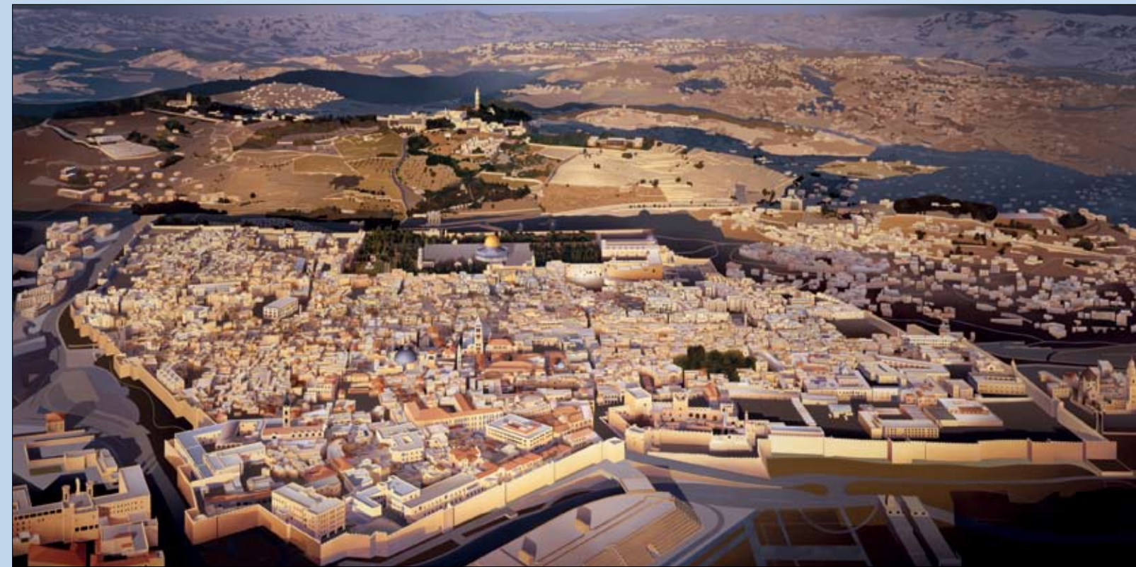
Jerusalem - The Eternal City