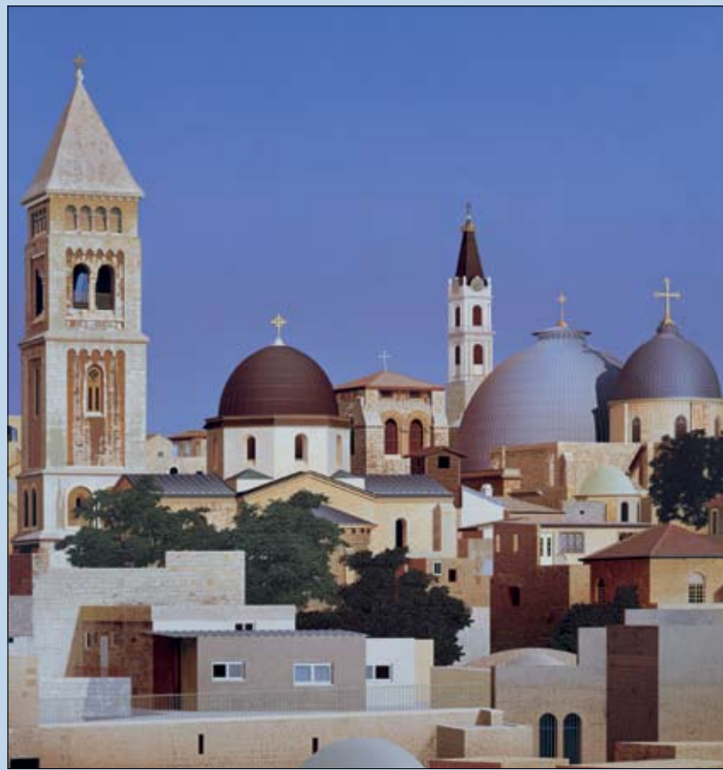
The Church of the Holy Sepulchre