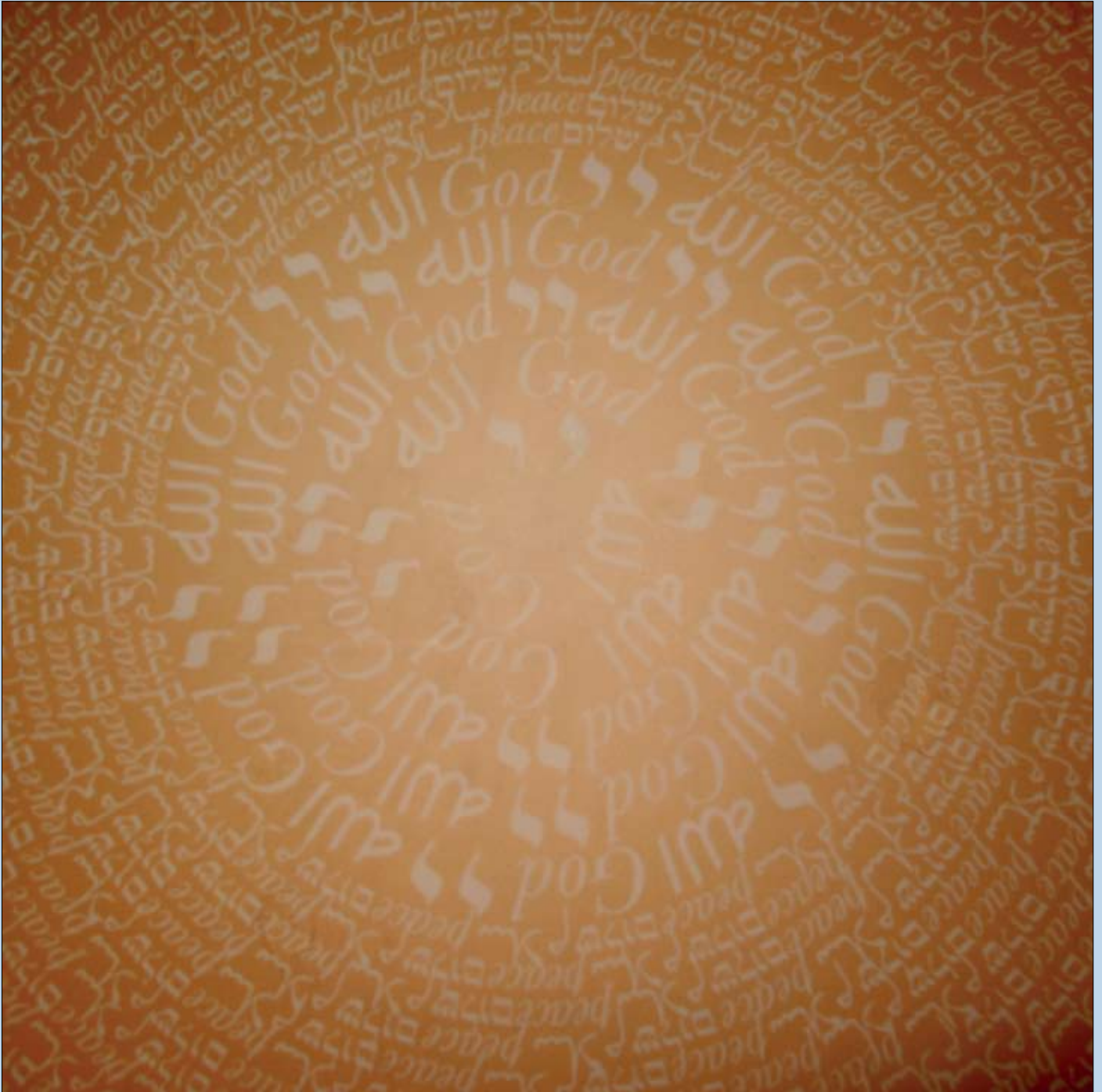
Detail, Circle of Peace