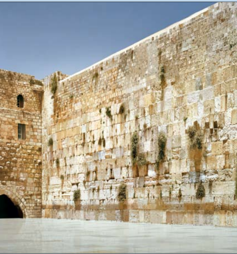
The Western Wall