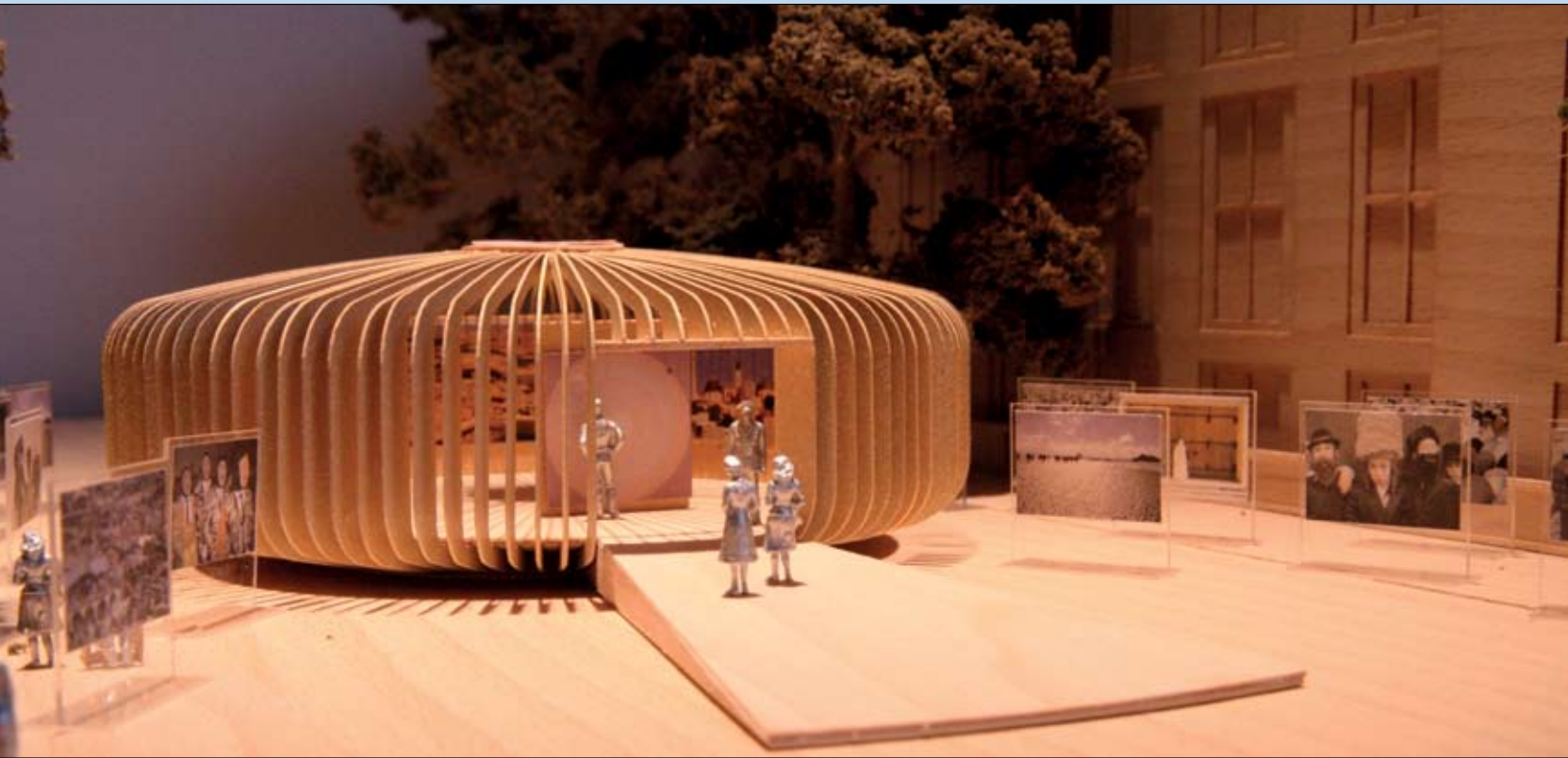
Sir Michael Hopkins' design of the House of Peace pavilion.

Since 1995 The Maimonides Foundation has fostered understanding and co-operation between Jews, Christians, and Muslims through cultural, academic, and sporting programmes. The foundation is committed to creating opportunities where these communities can meet and interact because we believe that dialogue is the only positive means of living in harmony in a multi-religious and multi-cultural society.